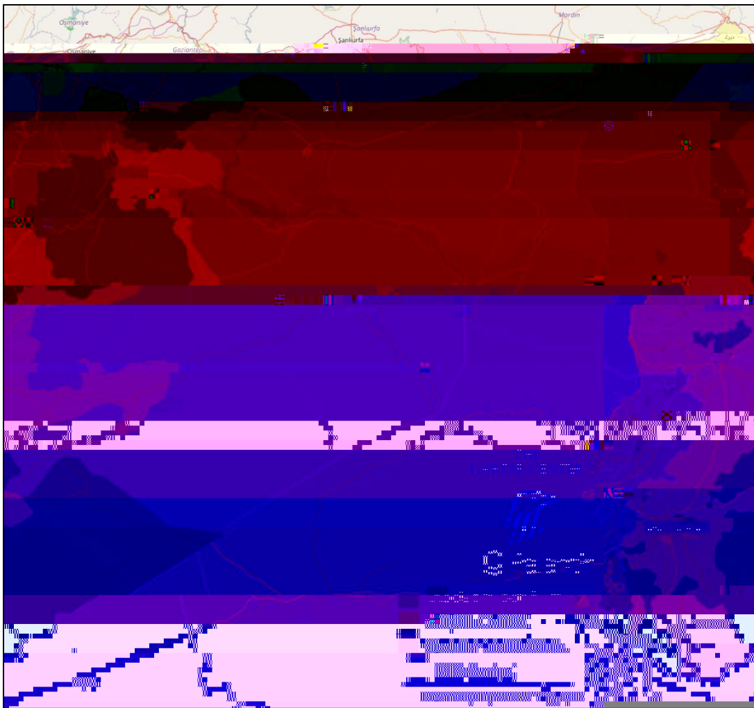
Figure 1 - Areas of control in Syria as of April 19

During this reporting period, negotiations surrounding the ongoing “Four Towns Agreement” continued despite the appalling attack on civilians being evacuated from the pro-government enclave of al-Fo’ah and Kafraya. Pro-government forces succeeded in their attempts to reverse the overwhelming majority of the opposition’s previous advances in northern Hama countryside, though fighting remains fierce. ISIS forces briefly retaliated after months of significant territorial loss, but continue to lose territory on several fronts. Opposition forces advanced against government forces in Daraa city and forced a minor withdrawal of pro-government forces to the east of Damascus.